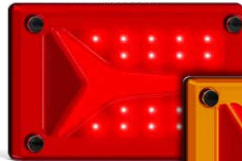
Stop/Tail Lamp 595RM - Single Blister

Brown - Tail, Red - Stop, Yellow - Indicator, Black - Reverse, White - Earth