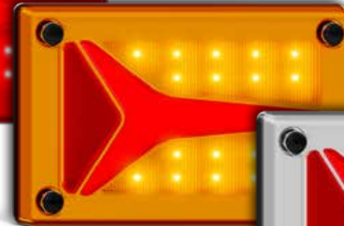
Rear Indicator Lamp 595AM - Single Blister